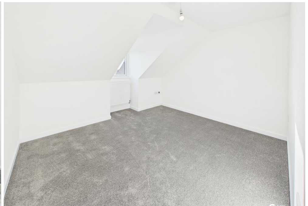
Treloar Close, St Austell, PL25 3GS